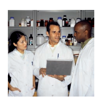
Group work is a necessity in today's workforce.

A percentage of students who read this book will one day become managers. For a manager, no skill area is more important than human relations abilities. A manager with good human relations skills will retain employees longer, be more productive, and provide employees with an enjoyable environment. The most common reason for failure in the job of manager is faulty human relations skills. Because interpersonal skills are so important, experts often suggest that new managers should put as much effort into studying people as they put into developing technical skills. Because interpersonal skills.